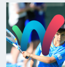
✘ Do not use over image