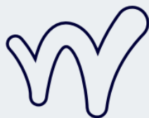
✘ Do not outline

Do not alter or recreate logo artwork under any circumstances.