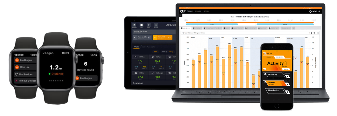
Figure 3. Catapult smartwatch app (left) and OpenField software (right).

Data can be transmitted in real-time to auxiliary devices in two ways. The first method uses a Catapult Vector Receiver unit (see figure 1) connected to an auxiliary device (e.g. a PC or tablet) running Catapult OpenField software. This method uses unique firmware on both the pod and Receiver unit to create a secure connection. The second method connects the pod to a smartphone or smartwatch running the Catapult Vector app (see figure 3) via Bluetooth. To ensure data security, the app requires the user to log in using registered credentials before the Bluetooth connection between the pod and auxiliary is established. Data are also stored on the pod and can be downloaded to the auxiliary device via a USB cable. The data transfer is managed through Catapult's OpenField software (see figure 3). The pod (and data) are assigned to a preregistered user account prior to data transfer.