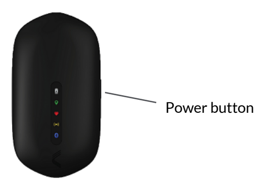
Figure 2. Catapult Vector S7 pod power button and status LEDs.

Data can be transmitted in real-time to auxiliary devices in two ways. The first method uses a Catapult Vector Receiver unit (see figure 1) connected to an auxiliary device (e.g. a PC or tablet) running Catapult OpenField software. This method uses unique firmware on both the pod and Receiver unit to create a secure connection. The second method connects the pod to a smartphone or smartwatch running the Catapult Vector app (see figure 3) via Bluetooth. To ensure data security, the app requires the user to log in using registered credentials before the Bluetooth connection between the pod and auxiliary is established. Data are also stored on the pod and can be downloaded to the auxiliary device via a USB cable. The data transfer is managed through Catapult's OpenField software (see figure 3). The pod (and data) are assigned to a preregistered user account prior to data transfer.