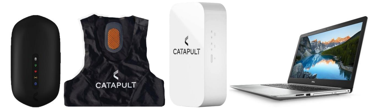
Figure 1. Components of the Catapult system (from left to right): Catapult Vector S7 pod; Catapult Vector Vest, Catapult Vector Receiver, auxiliary device (laptop). Not to scale.