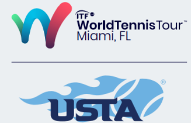
Stacked (On light)