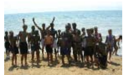
Training Camp participants at the Dead Sea