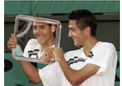
Marin Cilic (CRO)

Due to his impressive run to third round of the men's event, Andrew Murray has withdrawn from the junior tournament, thus opening the field for others to make their name at Wimbledon. Current junior world No.1 Donald Young (USA) will pose a threat to all those hoping to lift the coveted trophy. Although he lost in the second round of Roehampton's Grade 1 ITF Junior event last week, it was only his second outing on grass and after a week's practice on the surface, the Australian Open champion cannot be discounted and is No. 2 seed for a very good reason.