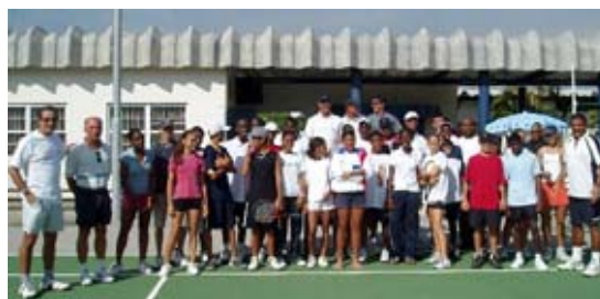
ITF 14 & Under Caribbean Development Championships.

The event was run on a round robin basis on days one and two, progressing to the main event held over the following four days which used the feed-in consolation system ensuring that every player, win or lose, played a match every day.