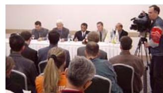
Addressing the course participants.