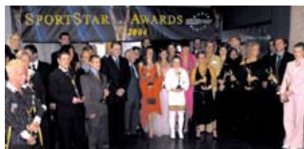
Some of the recipients of the SportStar Awards.

World No.1 Roger Federer of Switzerland and Olympic gold medal winner Justine Henin-Hardenne of Belgium received the tennis awards.