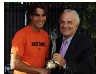
Rafael Nadal (ESP) and Francesco Ricci Bitti

The Spaniard was unable to collect his award at the ITF World Champions Dinner which took place during Roland Garros earlier this year.