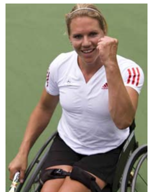
Esther Vergeer (NED)