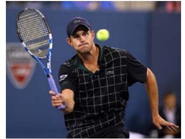
Andy Roddick (USA)

Roddick overcame Germany's Bjorn Phau 61 64 62 in Arthur Ashe Stadium while the Williams sisters, who have both claimed the title here, also safely progressed to the next round, although Venus had to fight back from a set down against Vera Dushevina (RUS). Other former US Open champions in action on the first day were Belgium's Kim Clijsters and Australia's Lleyton Hewitt. Clijsters, who returned to the tour earlier this year following a two-year absence, wasted little time defeating Viktoriya Kutuzova (UKR) 61 61 and will now face Marion Bartoli in the second round. No. 31 seed Hewitt overcame Brazil's Thiago Alves 60 63 64 and is on course to meet Federer in the third round, providing he prevails in his second round clash against Juan Ignacio Chela (ARG).