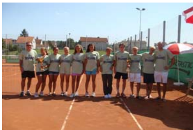
U14 & U16 teams and coaches

The 14 & under and 16 & under ITF/Tennis Europe Grand Slam Junior Touring Teams completed a successful four-week tour in Germany and Austria at the end of August.