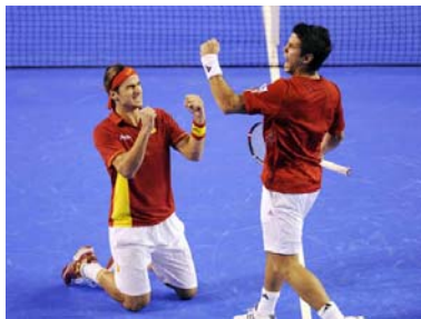
Feliciano Lopez and Fernando Verdasco (ESP)

Spain continues the defence of its Davis Cup title when the 2009 Davis Cup by BNP Paribas quarterfinals take place this weekend on 10-12 July. As well as the four quarterfinal ties, 20 Zonal Group I and II ties will be held, with full coverage on the official Davis Cup website www.daviscup.com .