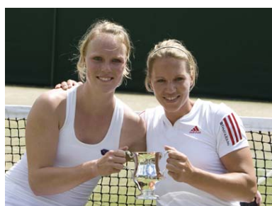
Korie Homan and Esther Vergeer (NED)

Dutch top seeds Korie Homan and Esther Vergeer made history on Sunday, cruising to victory in the inaugural Wimbledon women's wheelchair doubles, while Frenchmen Stephane Houdet and Michael Jeremiasz had a much tougher time before lifting the title in the men's wheelchair doubles.