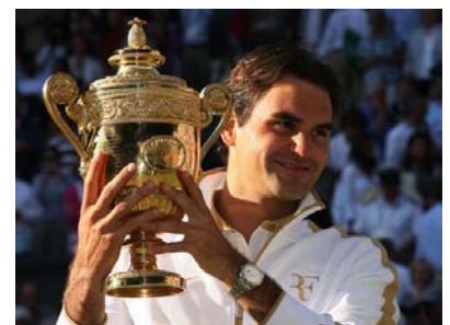
Roger Federer (SUI)

The match was the longest final in Grand Slam history at 77 games and contained the longest-ever fifth set. However, at 4 hours 18 minutes, it was 30 minutes shorter than last year's final, with both players dominating on serve. Roddick was left to regret missing four set points in the second set tiebreak, the last with a miss-hit volley with the court wide open. Having successfully held his first 37 service games, the American was finally broken in an epic final set lasting 95 minutes.