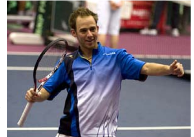
Dudi Sela (ISR)

Wimbledon finalist Andy Roddick has had to withdraw from the USA team to face Croatia on clay in Porec. Roddick has a hip injury, leaving James Blake, Mardy Fish and Bob and Mike Bryan attempting to reach the semifinals for the fourth year in a row. The team takes on an in-form Croatian team, which includes Marin Cilic, Ivo Karlovic, Roko Karanusic and Lovro Zovko.