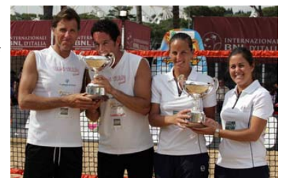
Beach Tennis World Champions 2009