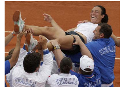
Italian team celebrates

Italy will now bid for its second Fed Cup title following victory over Belgium in the 2006 Final. Schiavone said: "It's amazing to be back in the final, it's a dream and I am very happy to be part of the dream." Captain Corrado Barazzutti added: "I am happy for the girls. We won this match not with the forehand or the backhand but with the heart".