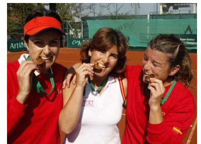
Spain's 2008 winning Suzanne Lenglen Cup team