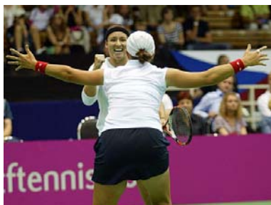
Liesel Huber and Bethanie Mattek-Sands (USA)

An astonishing contest in Brno saw Liesel Huber and Bethanie Mattek-Sands come back from the brink of defeat to beat Iveta Benesova and Kveta Peschke 26 76(2) 61 in the deciding doubles. The Americans saved a match point trailing 62 52, before fighting back to seal USA's first final appearance since 2003.