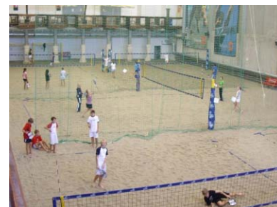
German Indoor Championships