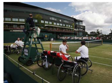
The 2008 Wimbledon wheelchair event

This year's inaugural women's event will follow the same format as the men's doubles, with four of the world's leading women's doubles partnerships competing for the top tier of world ranking points. The event is sanctioned by the ITF as part of the global NEC Wheelchair Tennis Tour.