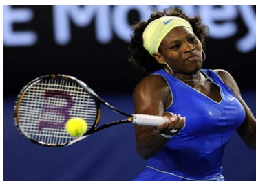
Serena Williams (USA)

Serena Williams won her fourth Australian Open title with an easy 60 63 victory over Safina. The American, who also became the highest earning sportswoman of all-time during the tournament, was in dominant form, as the Russian, who later admitted to suffering with nerves, struggled to find form.