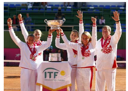
Russia's 2008 Fed Cup winning team

Olympic Gold medallist Elena Dementieva makes a return to Fed Cup after an absence of almost three years and headlines a strong Russian side which features world No. 7 Svetlana Kuznetsova, Anna Chakvetadze and Fed Cup debutante Alisa Kleybanova, who knocked out Ana Ivanovic in last week's Australian Open. The Russians will be a formidable opposition for the Chinese, who although they boast two players in the world's top 30 will face the defending champions on home soil in Moscow.