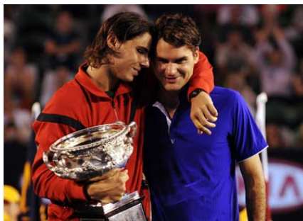
Rafael Nadal (ESP) & Roger Federer (SUI)

The two titles were decided in contrasting styles, Nadal took over four hours to subdue three-time champion Roger Federer, who was looking to equal Pete Sampras's record of 14 Grand Slam titles, while Williams took just 59 minutes to sweep past Dinara Safina.