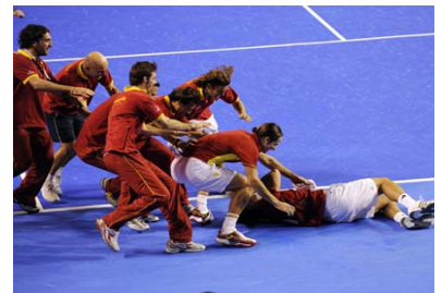
Spain celebrates

David Nalbandian gave the hosts a perfect start with a 63 62 63 victory over Spanish No. 1 David Ferrer. Feliciano Lopez then saw off Juan Martin Del Potro 46 76(2) 76(4) 63, before partnering Fernando Verdasco to a 57 75 76(5) 63 win over Agustin Calleri and Nalbandian.