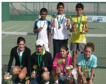
Tournament 2 winners

Syria dominated the two four-day tournaments which took place following a one-day training camp at the Group 4 ITF 13 & under Asian Championships. The competition was hosted by the Jordan Tennis Federation and held at the JTF Tennis Centre in Amman, Jordan.