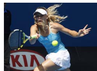
Caroline Wozniacki (DEN)