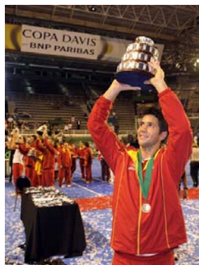
Fernando Verdasco (ESP)

After USA's triumph with a four-man squad in 2007, Spain's victory was a testament to the strength in depth in the team, with no less than six players contributing live rubber victories during the year. Nicolas Almagro, Nadal and Tommy Robredo also took part in the journey that saw three victories away from home, their victory over Argentina ending the hosts' 10-year unbeaten run on home soil.