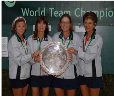
2007 Maria Esther Bueno Cup team winners - USA

The ITF will stage the largest-ever seniors World Team Championships in Antalya, Turkey starting on Sunday 12 October. A total of 323 teams from 34 countries is set to compete in 19 age categories from 35 and over to 80 and over at the Club Ali Bey resorts in Manavgat and Belek.