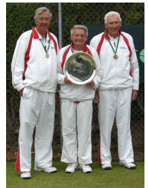
2007 Bitsy Grant Cup champions - Canada

The following week sees over 1000 competitors in action in the Seniors and Super-Seniors World Individual Championships. Results, reports and photos from both weeks will be posted daily on www.itftennis.com/seniors .