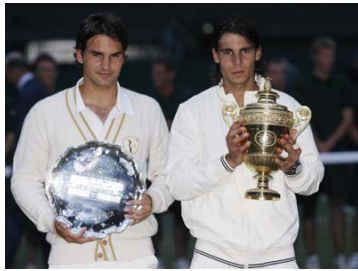
Roger Federer (SUI) and Rafael Nadal (ESP)

Rafael Nadal ended Roger Federer's five-year reign as Wimbledon champion by defeating the world No. 1 in a dramatic five-set final on Sunday. Earlier Venus Williams joined Federer on five Wimbledon titles with a straight sets victory over sister Serena in Saturday's women's final.