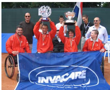
Dutch junior winning team