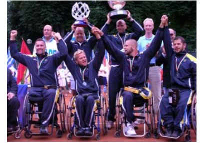
Sweden's winning men's team

During this year's event, title sponsor Invacare hosted an International and Scientific Symposium based around the topic of 'Sport and Disability'. Thirty coaches will participate in this week's ITF Wheelchair Tennis Coaches Workshop in Cremona, with the Cruyff Foundation and International Paralympic Committee helping to fund the participation of coaches not attending this year's World Team Cup.