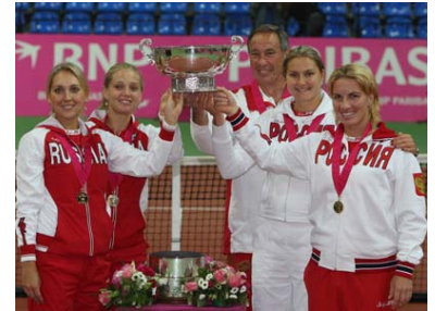
Fed Cup champions Russia

The tie saw heartbreak for Italian No. 1 Francesca Schiavone who lost two dramatic three-set matches as the visitors saw their six-match winning-streak come to an end. She let slip a 3-0 lead in the final set to lose the opening singles to Anna Chakvetadze 64 46 64, before Kuznetsova overwhelmed Mara Santangelo 61 62 to put the Russians in charge. Schiavone then missed two match points on the second day against Kuznetsova before losing 46 76(7) 75 in two hours 48 minutes. After serving for the match at 5-4 in the second set, the Italian held two match points in the tiebreak, and then squandered a 4-1 lead in the final set. Elena Vesnina overcame Mara Santangelo 62 64 in the dead singles rubber before the final doubles was cancelled.