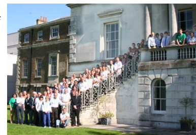
TST delegates at Whitelands College