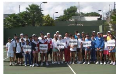
Participants in Nicaragua

The participating nations were Costa Rica, El Salvador, Guatemala, Honduras, Nicaragua and Panama. The Championships were held over six days and the singles events comprised a round-robin tournament on the first two days progressing to a feed-in consolation event over the following four days, which ensured that players played a singles match each day.