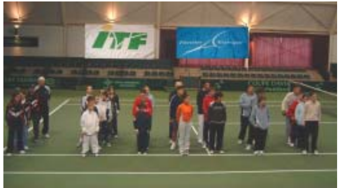
Participants at the 2004 Small States Championships