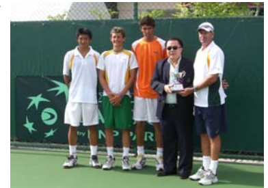
Australia's Junior Davis Cup team

The South America Junior Davis Cup & Junior Fed Cup by BNP Paribas qualifying was held in Lima, Peru, with Brazil defeating Argentina in the boys' final. Both teams qualify for the Junior Davis Cup Finals, alongside Chile who defeated Venezuela for third place. The girls' teams from Argentina and Chile took the two top spots in the Junior Fed Cup qualifying and will be joined by Paraguay, who dominated Venezuela in the third place play-off.