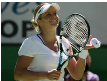
Kim Clijsters (BEL)

Former world No. 1 Kim Clijsters of Belgium has announced her retirement from tennis. The 23-year old spent nine seasons as a professional, winning 34 career singles titles and 11 doubles titles, and earning $14.5 million in career prize money. Her highlights included capturing her first Grand Slam title at the 2005 US Open, and leading Belgium to the 2001 Fed Cup title.