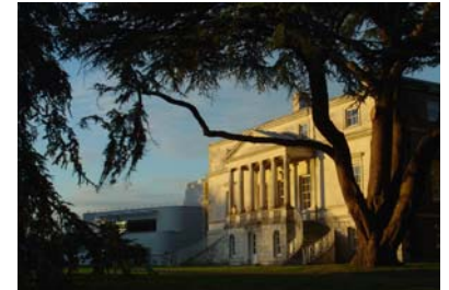
Roehampton University

For further information on the 3 rd ITF International Congress on Tennis Science & Technology, and to register as a delegate, please visit: http://www.itftennis.com/technical/tst/2007/ .