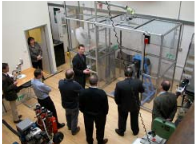
Media on a guided tour of the ITF Technical Laboratory

The Technical Centre is also monitoring racket performance using a purpose-built test device, which simulates a serve at speeds up to 155mph. Strings and stringing systems are also being tested, to establish how they influence the spin generated on the ball. Software that determines the combined effects of equipment on the nature of tennis was also presented.