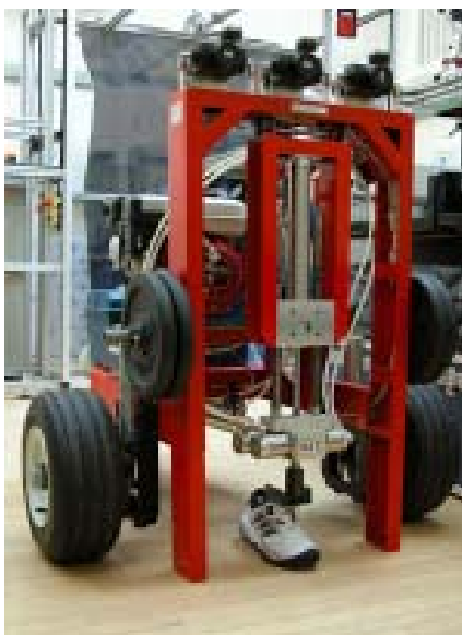
The ITF Sports Shoe Tester

Following the opening presentations, there was the opportunity for members of the media to go on a guided tour of the technical laboratory and see some of the ITF's testing machinery in action.