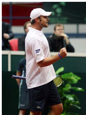
Andy Roddick (USA)

A capacity crowd of over 14,000 spectators will be supporting the US team in its quarterfinal against Spain on hard court at the Joel Coliseum in Winston-Salem. Andy Roddick, James Blake and the Bryan brothers make up an unchanged USA line-up, while Tommy Robredo heads the Spanish team in the absence of world No. 2 Rafael Nadal.