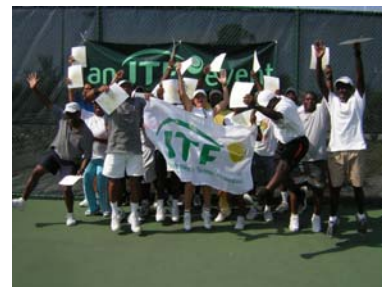
Course participants in Nassau