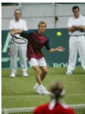
Juan Carlos Ferrero

Australia bids to avenge its defeat in the 2000 Davis Cup final when it takes on Spain in the World Group Final of the 2003 Davis Cup by BNP Paribas at Melbourne Park on 28-30 November.