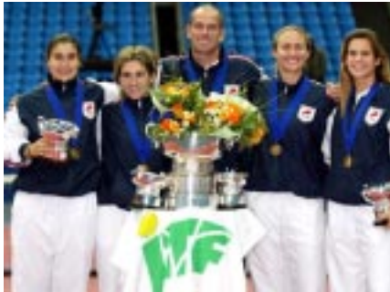
Winning French team

France ended a ten-match losing streak against the USA to capture only its second Fed Cup title at Moscow's Olympic Stadium on Sunday. Amelie Mauresmo defeated Meghann Shaughnessy 62 61 to give France a winning 3-0 lead en route to an eventual 4-1 final triumph.