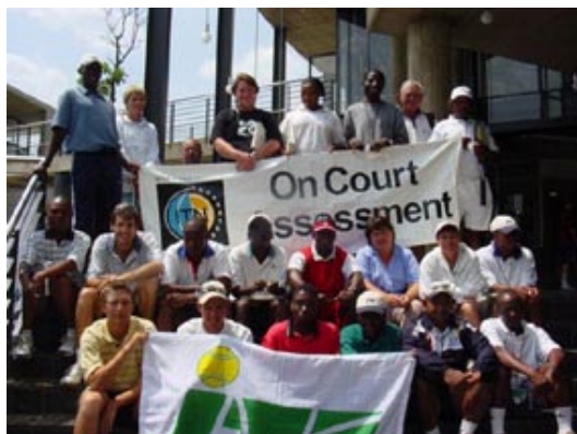
Participants at the Level II Coaches Course