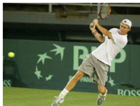
Lleyton Hewitt

The Aussies have been making the most of their grass court choice, not least of all Hewitt who shortened his tournament season to stay at home and prepare for the final. Much like his first major triumph, the 2001 US Open, which came after a rest, Hewitt is banking on his fresh legs that have played far fewer matches than Ferrero and Moya.