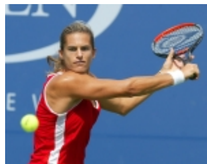
Amelie Mauresmo

More information, including how to obtain tickets, can be found at the official tournament website at www.wtachamps.com or on tel +1 866 982 2426.