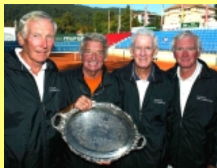
Canada, Jack Crawford Cup Champions for the last three years

Further details, including a list of participating teams, can be found at www.itftennis.com/vets .