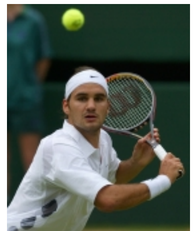
Photos of Juan Carlos Ferrero (top left) and Roger Federer (above)

Further details of the Davis Cup ties taking place 19-21 September, including the latest team and draw news, match reports, photos and live scoring from the World Group Semifinals and Play-offs can be found at the official website www.daviscup.com .