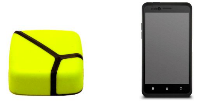
Figure 1. Components of the ZEPP Tennis system: ZEPP Tennis pod (left); auxiliary device (smartphone).