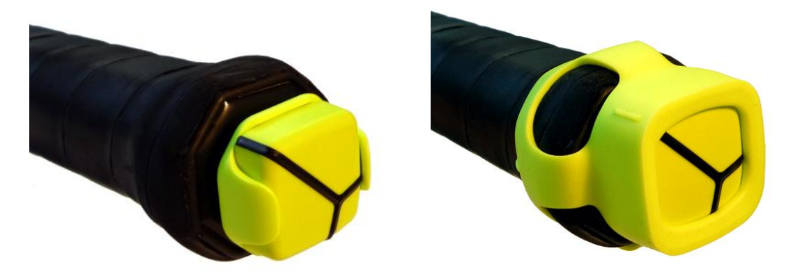
Figure 2. ZEPP Tennis pod attached to the butt of a racket using the Pro (adhesive) Mount (left) and Flex (elastic) Mount.

A 'pod' containing electronic sensors (a gyroscope and two accelerometers) is attached to the butt of a racket, with an adhesive or elastic mount (see figure 2). The sensors in the pod measure the orientation and acceleration of the racket, and vibration of the frame (on impact with a ball). The mass of the pod is 8 g. The masses of the Pro Mount and Flex Mount are 4 g and 13 g, respectively.