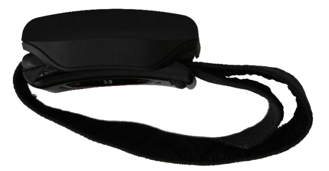
Figure 4. Battery pack fitted to the WHOOP 3.0 for charging in-situ .

The LED display also indicates the battery level. It does not illuminate at other times (e.g. during data collection). The device can be charged while worn on the wrist by sliding the battery pack on top of it (see figure 4).