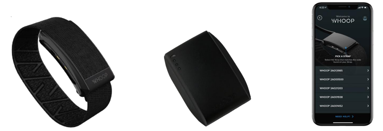
Figure 1. Components of the WHOOP 3.0 system (from left to right): WHOOP 3.0 device, battery pack and auxiliary device (smartphone). Images are not to scale.

Table 1. Description of the components of the WHOOP 3.0 system.