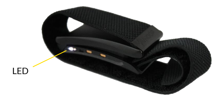
Figure 3. White LED indicating pairing mode is active.

The Bluetooth pairing mode is activated by tapping the device. A white LED will illuminate, indicating the device is in pairing mode (see figure 3). The device can then be paired to the user's account in the app on the auxiliary device.