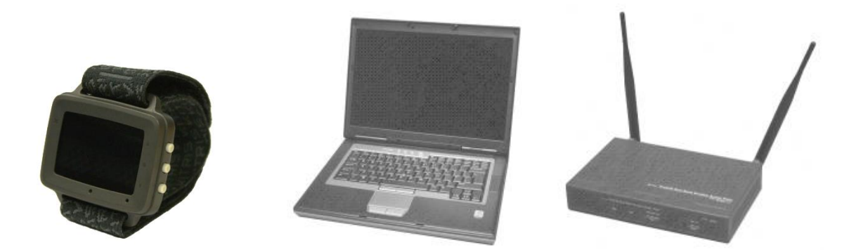
Figure 1. Components of the KITRIS KIT BIA system (from left to right): KIT device; auxiliary device (laptop); internet access to KITRIS server (router).

Table 1. Description of the components of the KITRIS KIT BIA system.