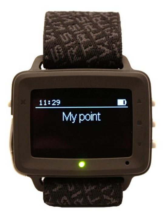
Figure 3. LED confirmation of point input (green light signifies point won by the user).

When point information is not being entered, the score is displayed on the device in the standard tennis format (in addition to the device time, as set by the user).