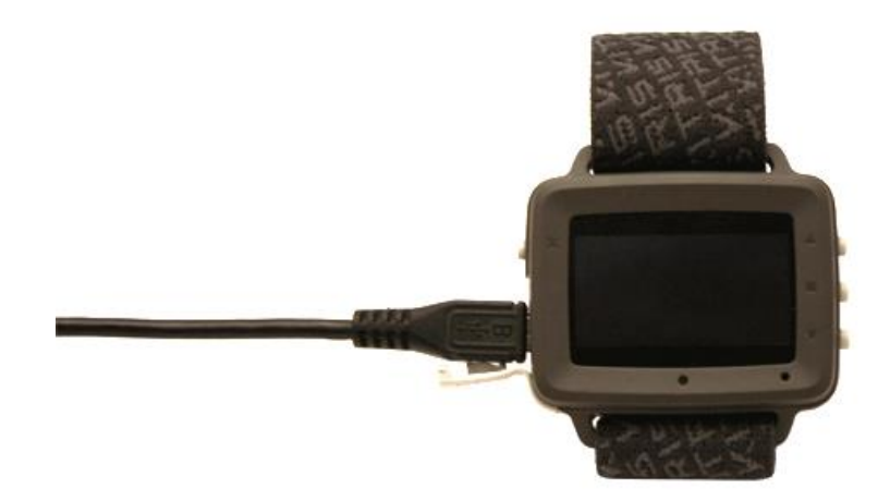
Figure 4. USB connection of the KIT device (to an auxiliary device).

The auxiliary device must have KITRIS Tennis HUB (proprietary software) installed to be able to receive the files.