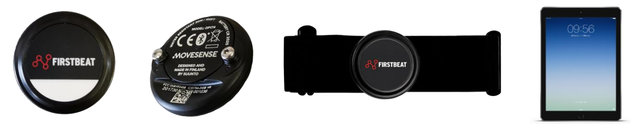
Figure 1. Components of the Firstbeat system (from left to right): Firstbeat Sports Sensor (front and back), Firstbeat Sports Sensor in textile belt and auxiliary device (iPad). Images are not to scale.