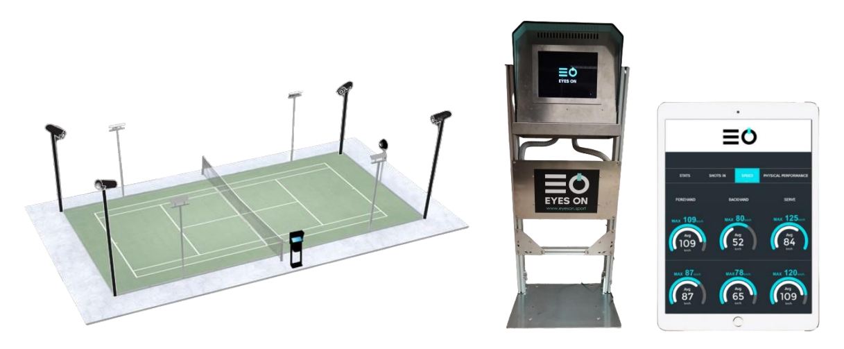
Figure 1. Components of the Eyes On system (from left to right): Standard court set up displaying cameras and kiosk; kiosk unit; auxiliary device (tablet) displaying the Eyes On app. Not to scale.