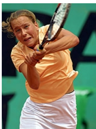
Barbora Strycova (CZE)