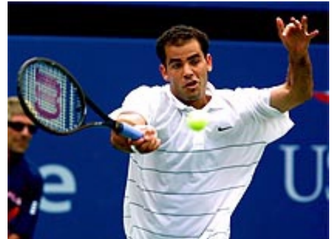
Pete Sampras (USA)

The top seeds are still in contention in the men's and women's doubles championships. Mark Knowles and Daniel Nestor and reigning US Open women's doubles champions Lisa Raymond and Rennae Stubbs are in the Round of 16 in their respective events. There was a shock in the opening round of the mixed doubles with the favourites and defending champions Rennae Stubbs and Todd Woodbridge of Australia exiting at the hands of Martina Navratilova and Leander Paes.