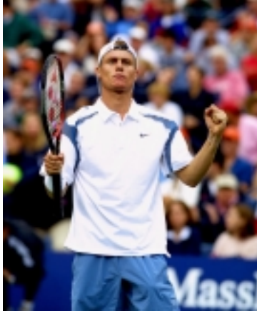
Lleyton Hewitt (AUS)

The second week of action from Flushing Meadows, New York is set to unfold with the defending champions Lleyton Hewitt and Venus Williams still very much in the running.