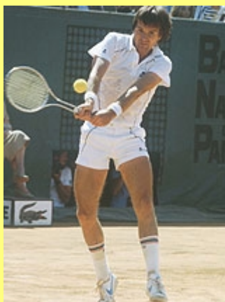
Jimmy Connors (USA)