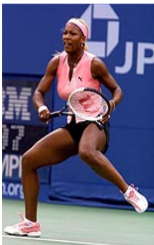
Serena Williams (USA)

Of those most likely to shine in New York, 16-year-old Gasquet looks like being one of the title favourites. The French boy caused a sensation earlier this year by becoming the youngest person ever to win an ATP Masters Series match aged 15 years. (Continued on page 2)