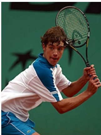
Richard Gasquet (FRA)

The US Junior Open kicked off on Sunday 1 September with the boys' draw promising a close fight for supremacy and the possibility of a new star emerging in the girls' event.